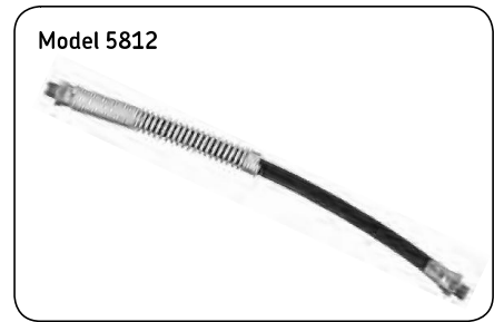
Strategically placed coil spring provides nonslip, push-pull grip and prevents accidental kinking which could cause hose ruptures.