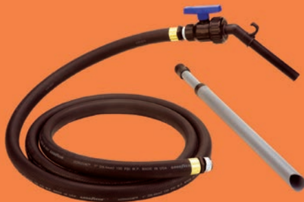
Herbicide Kit #111502-2