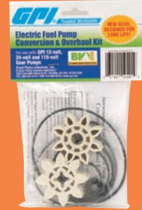
Overhaul Kit #110504-1