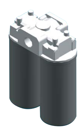
800HS w/Dual Adaptor