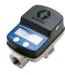
SDI15 In-Line Meter