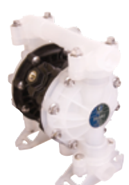
SD Blue AODD Pumps