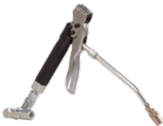
Pro-Shot Control Valve