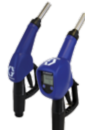
LD Blue Automatic Dispense Nozzles