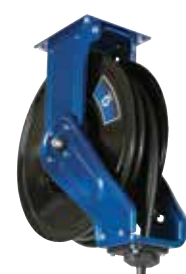
XD Series 10/20/30