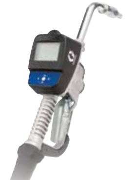
SDM and SDP Meters