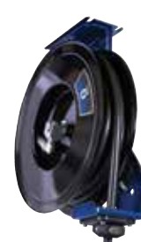
SD Series 10/20