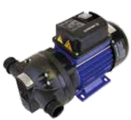
LD Blue Electric Pumps