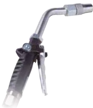
XDV20 Control Valve