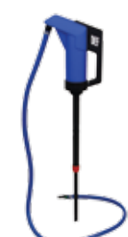
LD Blue Manual Pumps