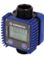
LD Blue Meter