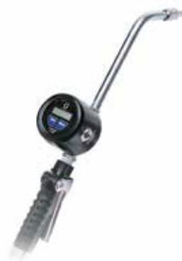
XDM6 and XDM12 Meters