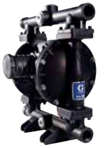
Husky™ Diaphragm Pumps