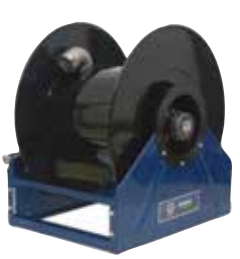
XD Series 60/70/80 Powered Reels