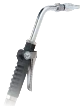
SDV15 Control Valve