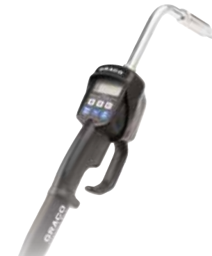
LDM and LDP Meters