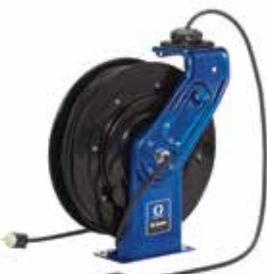
SD Cord and Light Reels