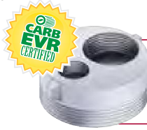
TGTA-0400 4" Tank Bung Gauge and Alarm Combo Fitting Note: Drop Tube must be used with TGTA-0400.

444TA and 144TA Instruction Sheet Order Number: 200655