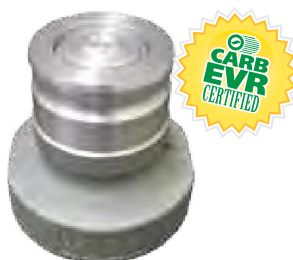
Kamvalok® Adaptor for Direct Fill

1611AN Adaptor Instruction Sheet Order Number: 204016