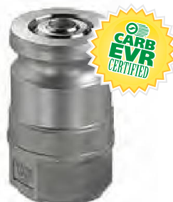
Poppeted Kamvalok® Couplers for Remote Fill

1611AN Adaptor Instruction Sheet Order Number: 204016