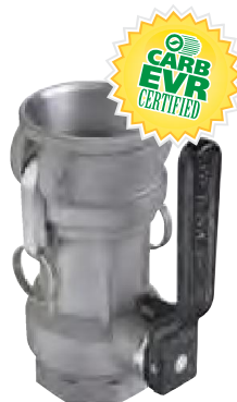
Poppeted Kamvalok® Couplers

H32116PA Coupler Instruction Sheet Order Number: 204016