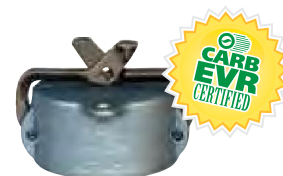
Lockable Dust Plug